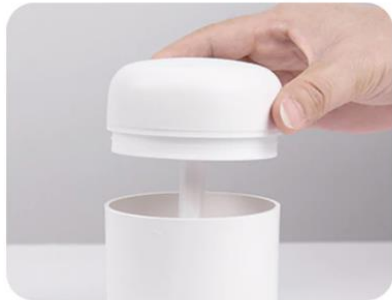
1.Pull up the cover