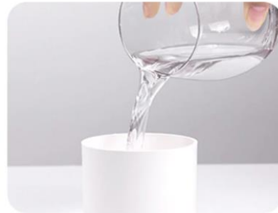
2.Add water to the water tank