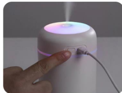
4.Click the power button to start working