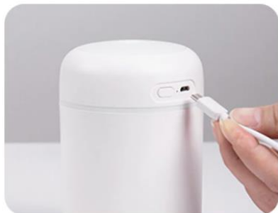
3.Press down the lid tightly and connect the power